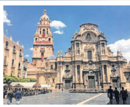
MURCIA THE MERRIER... town's stunning cathedral, Roman theatre at Cartagena, below, and picturesque harbour at Cabo de Palos, bottom

and even a giant wuss like me managed to get on the act. I'd never even heard of paddle-boarding but before I knew it I was riding the waves like a cool surfer dude — well, I did for around ten seconds before I was blown off by a giant wave and crashed screaming into the sand as my pals looked on laughing. After my exertions in the water, I decided a couple of drinks and a snooze by the