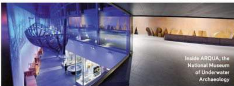
Inside ARQUA, the National Museum of Underwater Archaeology

EAT If you go to Murcia city, said to serve some of the tastiest food in Spain, head to Plaza de las Flores – a pretty square in the old quarter with bars serving the best tapas in town. Visitors to the region should also try local speciality cañero , a rice and seafood dish. And for dinner with a view, Zoco del Mar sits on the hillside by the Castle of San Juan de las Águilas in Águilas.