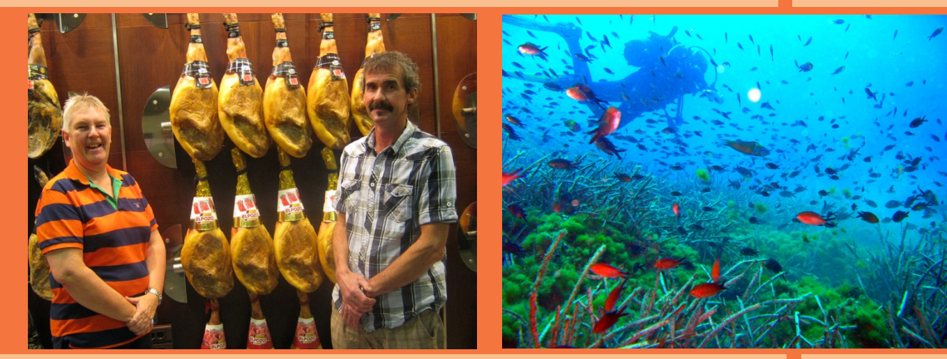
SPANISH AND SCUBA DIVING

Airport transfer not included. Please ask for further details